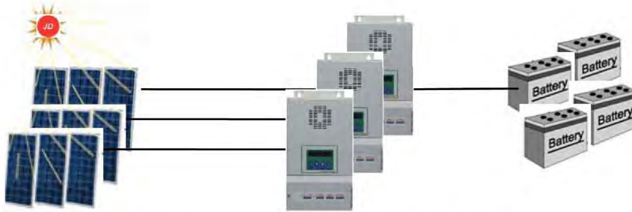
180W x 312 pcs modules