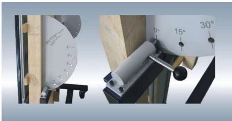
Subframe /mounting system angle adjustable ( in 15° steps )