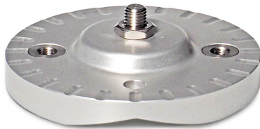
Figure 4 several mounting options are offered with SR15-A1, such as this spring-loaded levelling mount for easy mounting, levelling and instrument exchanges on flat surfaces