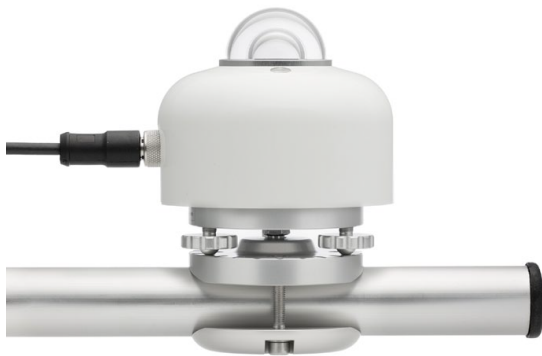
Figure 5 SR15-A1 with optional tube levelling mount