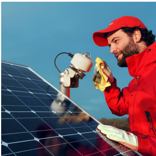
Figure 2 SR15-A1 pyranometer mounted in POA (Plane Of Array) on a mast for PV performance monitoring