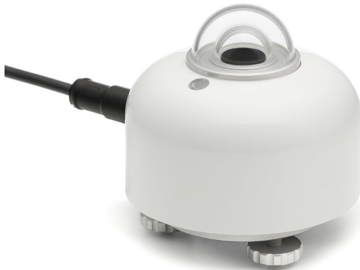
Figure 1 SR15-A1 first class pyranometer with heater

SR15-A1 is a high-accuracy solar radiation sensor. It is "first class" according to the WMO guide and ISO 9060:1990 standard and "Spectrally Flat Class B" in the 2018 revision. With its on-board heater, it is compliant in its standard configuration with the requirements for "Class B" PV monitoring systems of the new IEC 61724-1:2017 standard.